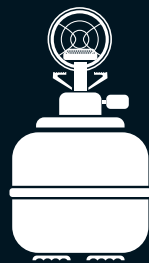
Portable Fuel Heater